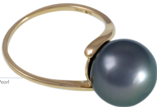
18ct Gold Ring