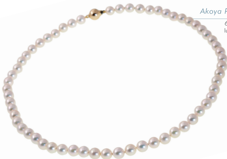
Akoya Pearl Strand

60, 6.5mm AAA lustre pearls with 9ct gold clasp